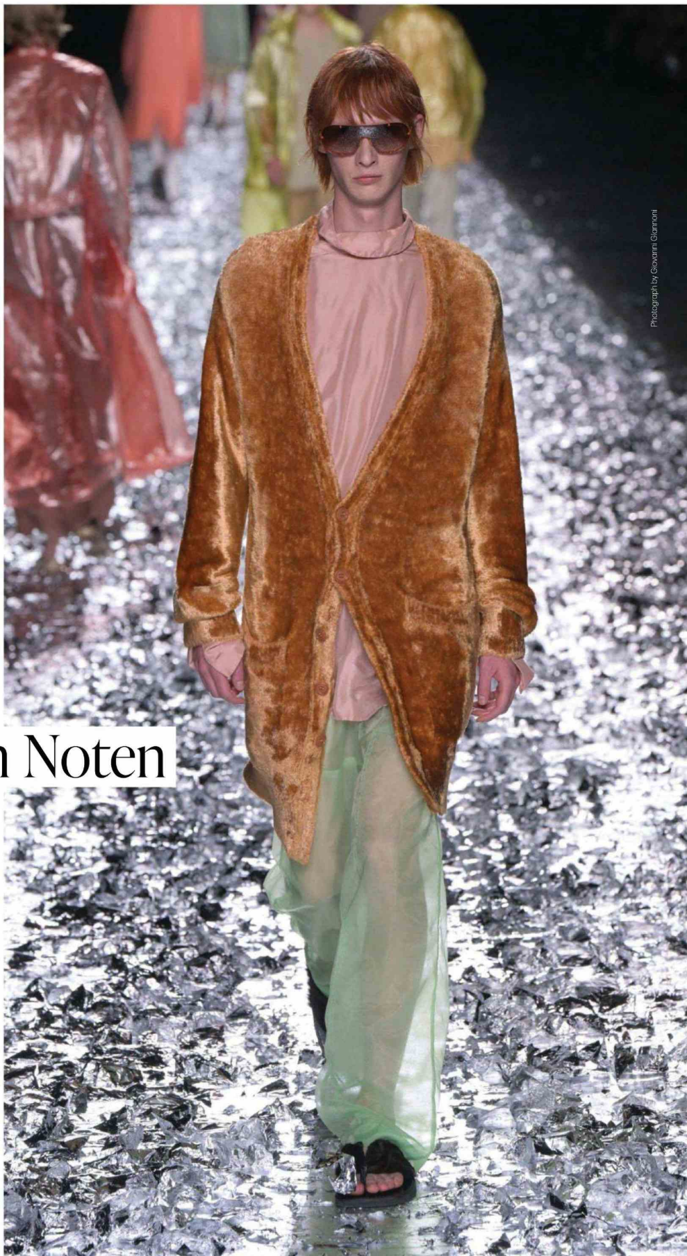
Photograph by Giovanni Gastel