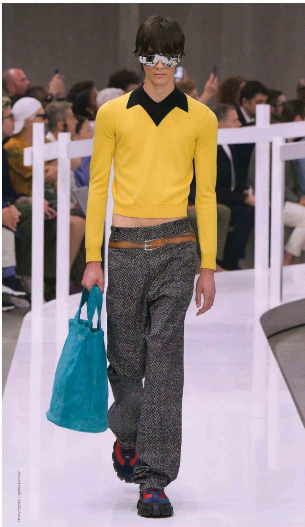
Photograph by Giovanni Gastel