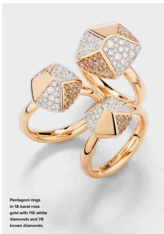
Pentagoni rings in 18-karat rose gold with 110 white diamonds and 78 brown diamonds.