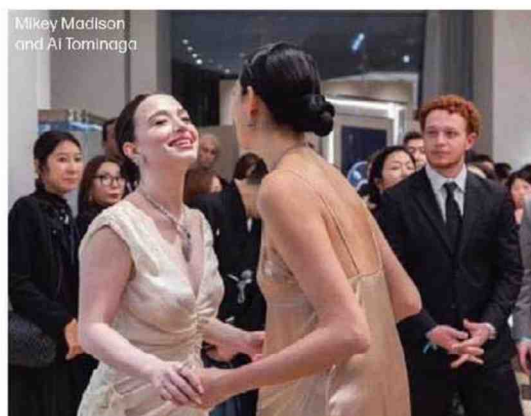
Mikey Madison and Ai Tominaga