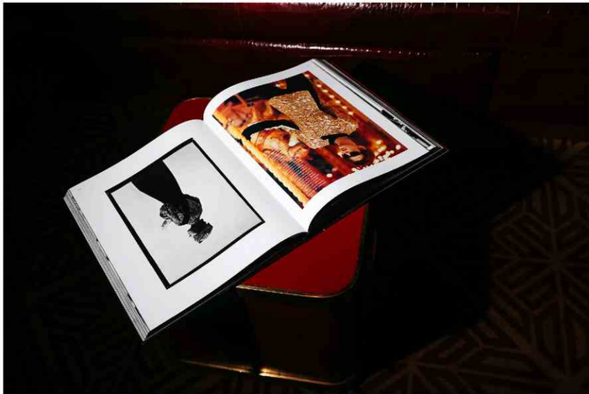
The scene at Sofia Coppola's book launch with Chanel.